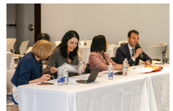
The judges' table included representatives from academia, finance and the diplomatic community to evaluate the student teams

It is anticipated that the Euro Challenge Canada event can be expanded upon for next year with more teams participating from across Ontario.