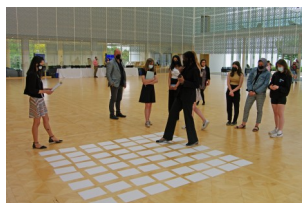
Students participated in an activity during the intermission

passports or stop at the borders between countries.”