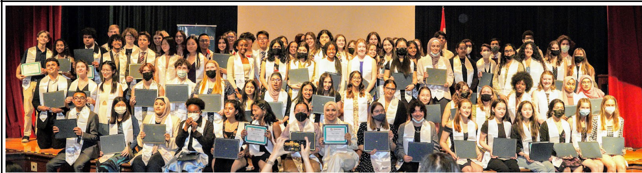
Students who graduated from the OCDSB International Certificate Program are all smiles as they gathered to celebrate their achievements and show off their new certificates at a ceremony held at the Ottawa Technical High School

Since the inaugural International Certificate graduation ceremony in 2013, almost 600 students have graduated from the International Certificate Program (ICP).