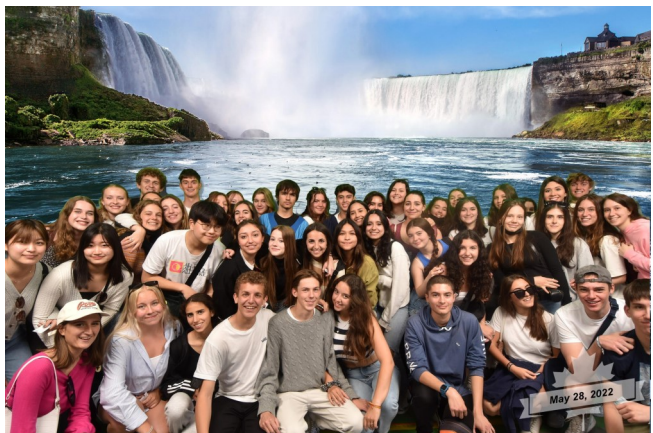
International students welcomed the chance to participate in OCENET's 3-day field trip excursion during the weekend of May 27-29 to explore Toronto's landmarks and to visit iconic Niagara Falls