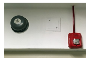
New alarm systems enhance safety throughout the building

placed in designated areas. This work was done from June 2021 to February 2022 and some finishing upgrades will continue as needed to improve the safety and functionality of 440 Albert St.