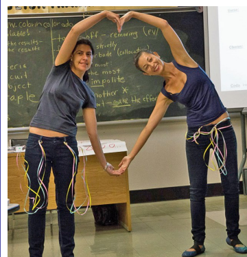
To the enrichment and enjoyment of their Spanish classmates participating in the CLIL Teachers’ Training Program offered by OCENET each summer, two dance teachers demonstrate a sample lesson on ways to integrate learning content with English language acquisition

OCENET is recognized for its superior teacher training programs. Throughout the year, many groups and delegations visit from foreign countries to enhance their professional development and learn about pedagogical innovations practiced in Ontario. One such program is the CLIL (Content and Language Integrated Learning) Teachers’ Training Program which hosts teachers from Spain for three weeks in the summer and again in the fall. Spanish teachers learn and practice innovative English language pedagogical methodologies by teaching language development through differentiated communication approaches, reflective teaching, and varied assessment strategies. When not attending classes, teachers have opportunities to attend cultural events and explore the Ottawa area.