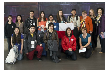
Chilean students are welcomed at Ottawa Airport by host families

ernment selected 40 Chilean students to attend Canadian high schools this school year for one semester. Four of these students are currently attending OCDSB high schools. For these Chilean students, this initiative will enhance intercultural understanding and promote English language development.