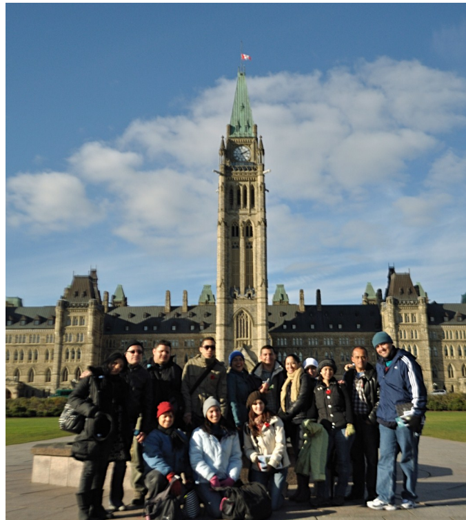
Teachers from Costa Rica brave the elements on Parliament Hill