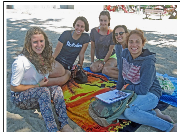
About to enjoy a picnic on the beach at Mooney's Bay, students from Germany enjoy their time in Ottawa

Each fall groups of international students come to Ottawa to experience Canadian culture, develop their English skills, attend classes at OCDSB schools and experience all that Ottawa and area has to offer these visitors. In September a group of 15 scholarship students from Navarra, Spain, arrived for one month, and in October, nine students from Germany attended local public high schools for four weeks. The OCDSB is also hosting scholarship students from Brazil who would not normally have had the resources to attend schools abroad. In future months, international student groups will be visiting from China, Colombia, South Korea and Spain with an emphasis on building English language proficiency.