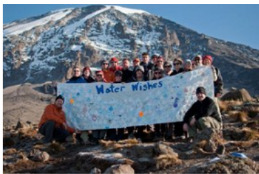
Canadian climbers on WaterCan’s Kilimanjaro Climb for Life display the Water Wishes banner

Through a cross-curricular approach that focussed on global water resource issues, the students and staff at Stephen Leacock PS began a series of classroom activities that evolved into an international project. As part of the initiative, representatives from Engineers without Borders spoke to a science class and the art classes created a water-themed art gallery.