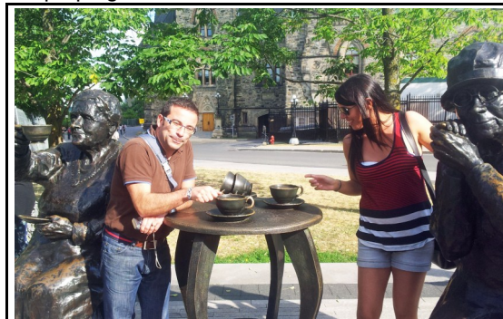
Two teachers from Galicia, Spain, enjoy a cup of tea with the statues of the Famous Five while exploring on Parliament Hill

The increase in the number of international visitors is a testament to the internationally recognized high standards of education delivered at OCDSB schools and in Ontario.