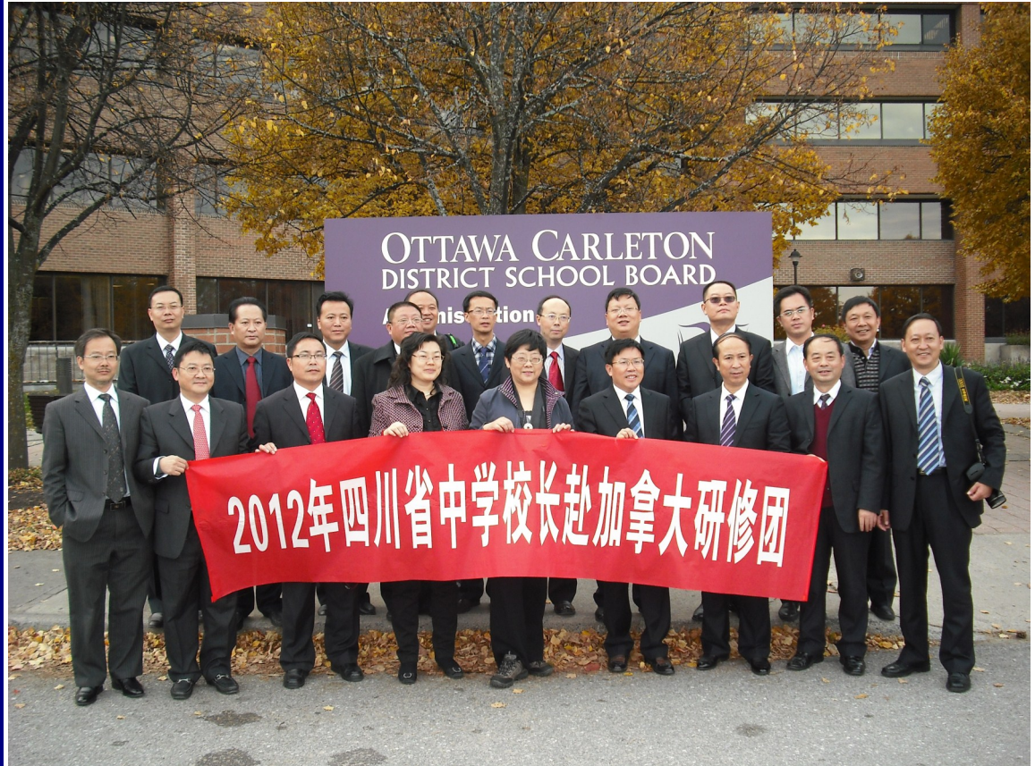
In October, a delegation of educational leaders from Sichuan Province in China attended presentations at the OCDSB offices and toured Sir Robert Borden HS as part of a cross-Canada tour to learn about exemplary educational practices