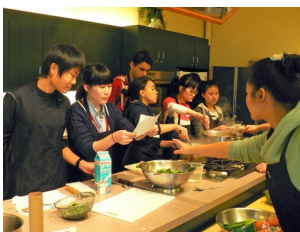
International students sharing their new culinary skills

On November 17th, many international homestay student participated in a cooking class aimed to assist them become more comfortable in a Canadian kitchen. The students were divided into teams and coached by a chef