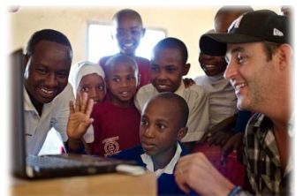
A class in Tanzania skypes with students at Stephen Leacock PS

and 8 students had an opportunity to skype with students from a school in Tanzania to ask questions about daily life in each country and issues related to the importance of clean and accessible water.