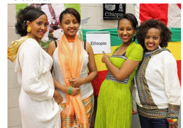
Adult High School students from Ethiopia enjoy sharing their cultural background at the annual Global Village Fest