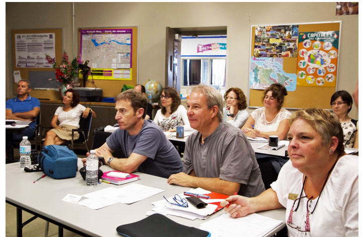
Teacher training workshops on a wide variety of educational topics are tailored to the needs of visiting educators and delivered by OIPE trainers, as well as expert teachers, principals and senior staff of the OCDSB in the learning centre at 440 Albert Street.

from one week to five months. The team, working in conjunction with the OCBSB and individual schools, analyzes each request and crafts a program or curriculum that is right for each group and ultimately provides an enriching, fruitful experience that addresses all requested topics. Study tours to the OCDSB are usually a week long and have included topics such as : • “Inclusiveness” • “Educational Leadership Training” • “Strategic Planning for Student Achievement” • “Instructional Coaching Model” • and the OCDSB’s “Strategic Plan and District Review Process”.