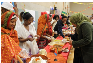
Students and staff at Adult High School get involved to share a taste of foods, music, dance and culture from around the world

On November 6 the gym at Adult High School transformed into a global village with all of the students and staff participating in a huge celebration of each other's cultural heritage.