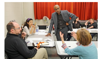
OCENET staff in group discussion at the IDI Professional Development workshop