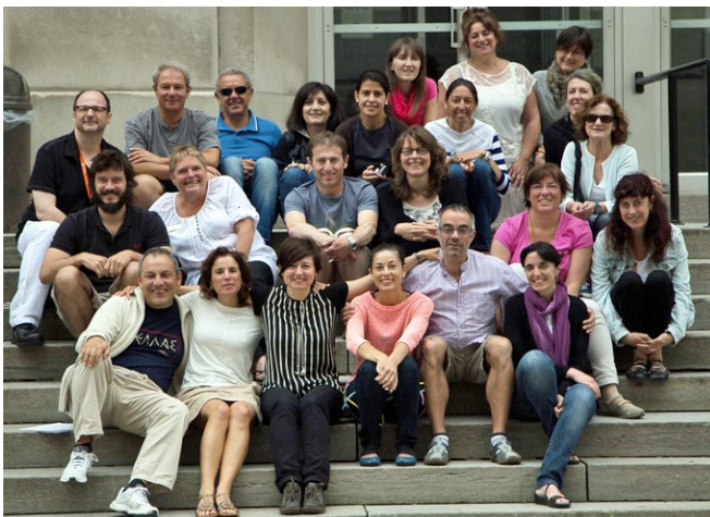
The CLIL Teacher Training program welcomes teachers from Spain and elsewhere, who attend a course that focuses on exemplary pedagogical techniques for teaching in English Immersion classrooms.

Tailored Programs The length of programs varies