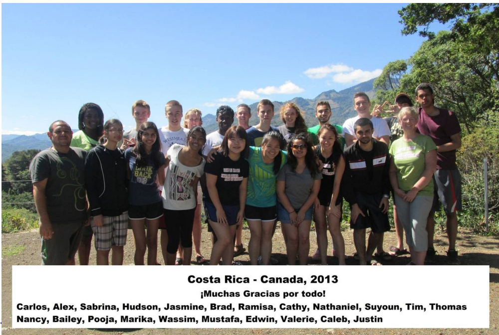
Costa Rica - Canada, 2013

While in Costa Rica, the students and teachers became part of the community by living with local host families. Everyone benefitted from a genuine cross-cultural experience of “learning while doing.”