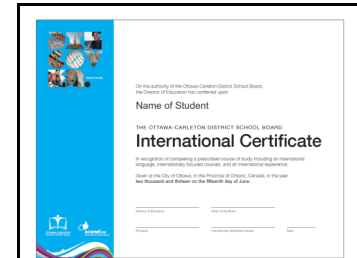
The first group of students received the OCDSB International Certificate at a special ceremony

Information about the OCDSB International Certificate Program is available by contacting the International Education Coordinator or visiting the OCDSB website: http://www.ocdsb.ca/program/intl/Pages/ICP.aspx