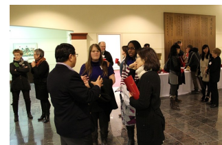
Many OCDSB staff attend the Korean movie nights held each month