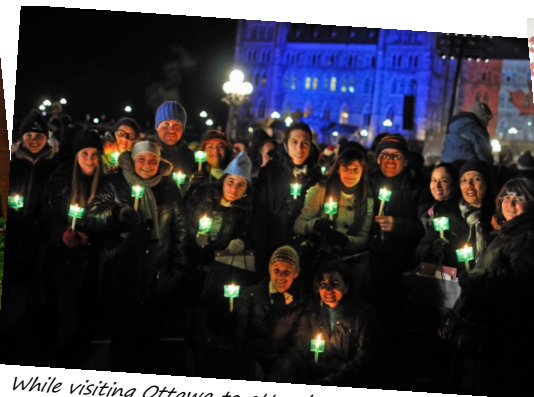
While visiting Ottawa to attend an OCENET teacher training program and observe teaching practices in OCDSB schools, a group of 15 educators from Costa Rica took time out of their schedule to experience an evening visit to Parliament Hill