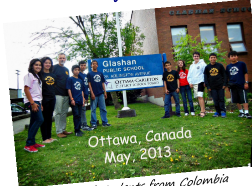
International students from Colombia enjoying their Canadian experience at Glashan Public School