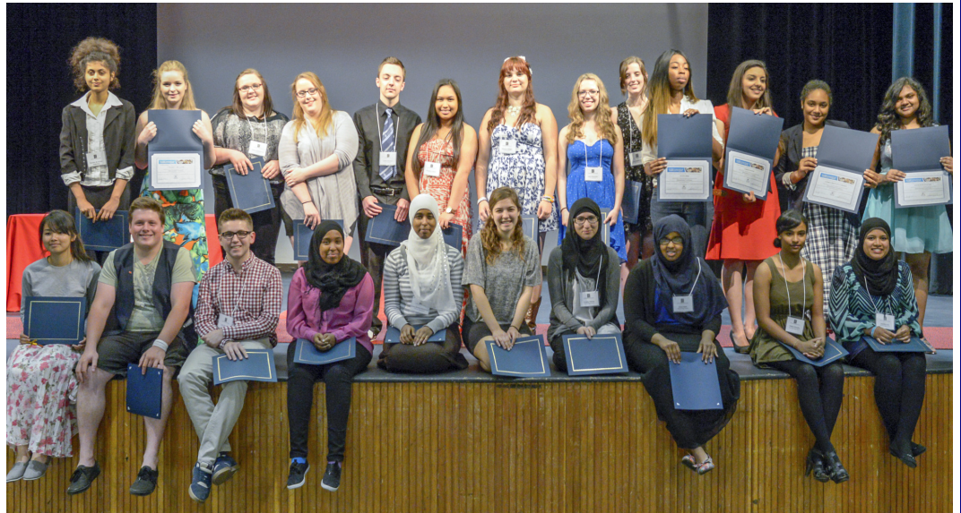
Many of this year's 31 recipients proudly display their OCDSB International Certificates on the stage at a special awards ceremony held at Sir Robert Borden High School on June 19