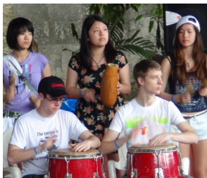
Several members of the WHS Band participated in a Latin percussion workshop in Cuba, where they also visited a community centre and volunteered at an orphanage

Woodroffe High School is a leader in providing students with opportunities to participate in internationally focussed experiences.