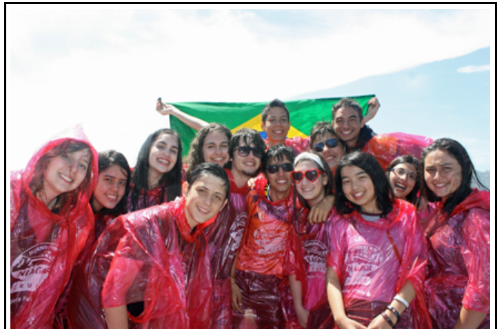
Even though they may have got wet, it is obvious from the beaming smiles that the Ottawa international students enjoyed their visit to Niagara Falls

One of the most popular trips is the cultural tour to Niagara Falls and Toronto. During the weekend of May 30 to June 1, forty-two international students and five chaperones boarded a luxury bus coach and enjoyed three jam-packed days by visiting iconic locations in southern Ontario. The trip included a stop enroute to the historic city Kingston,