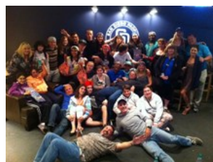
Students and teachers from the GLP Life Skills Class pose for a group shot during their trip to Southern California