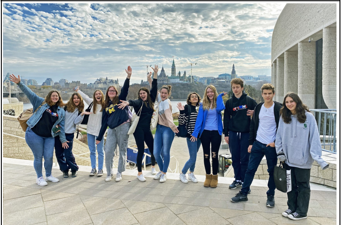
Students participating in the OCDSB's Aix-en Provence exchange enjoying their experiences in the Ottawa area at the Museum of History with the iconic view of Parliament Hill in the background across the Ottawa River. Following the travel restrictions imposed by the pandemic, OCENET is pleased to see the return of in-person student groups and teacher training programs. See their stories on pages 2, 4, and 5.