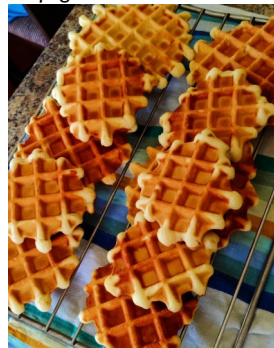
With Homestay Category - Mick Steppe