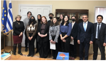
Members of the staff at the Greek Embassy in Ottawa, Global Affairs Canada and nine ICP students participated in planning the visit for a diplomatic visit

The International Certificate Program (ICP) introduces OCDSB secondary students to wide range of leadership opportunities, both internationally and locally.