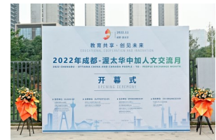
Opening Ceremony in Chengdu