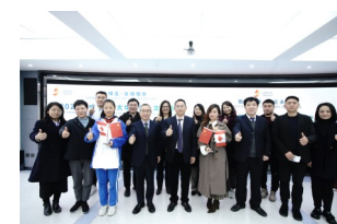
Closing Ceremony in Chengdu