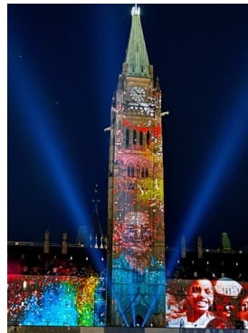
Around Ottawa Category - Yiqing Chen