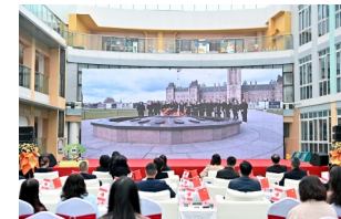
OCDSB students at Parliament Hill's Centennial Flame at the Opening Ceremony