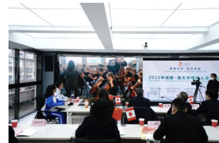
Closing Ceremony in Chengdu featuring a performance by students in the strings orchestra from Canterbury HS