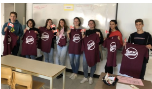
Students on the Aix Provence exchange received new t-shirts at South Carleton HS