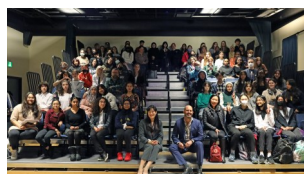
ICP students at the closing of the Korea Forum 2022