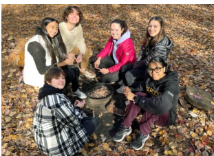
On a beautiful day in late October, students on the exchange learned new skills including cooking hot dogs over a fire and making S'mores at the MacSkimming Outdoor Education Centre