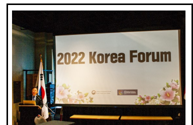
Ambassador of the Republic of Korea, His Excellency Lim Woongsoon, welcomed the audience of 70 OCDSB International Certificate students to Ottawa’s the Korean Cultural Centre on Elgin Street