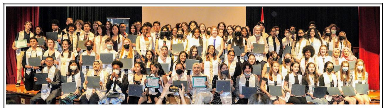
Students who graduated from the OCDSB International Certificate Program are all smiles as they gathered to celebrate their achievements and show off their new certificates at a ceremony held at the Ottawa Technical High School

Since the inaugural International Certificate graduation ceremony in 2013, almost 600 students have graduated from the International Certificate Program (ICP).