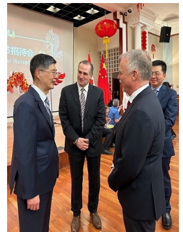
Meeting the Chinese Ambassador to Canada, H.E. CONG Peiwu, at the Chinese Embassy's Spring Festival Celebration