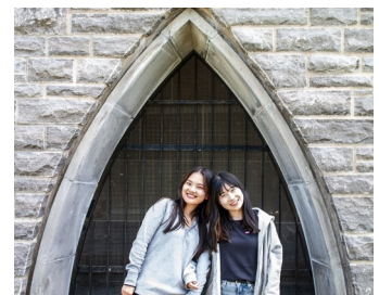
YPLS students posing within a "frame within a frame" shot

raphy presentation by OCENET's International Education Consultant and keen amateur photographer, Ross Laing, the students took their cell phone cameras to use 10 specific techniques for taking better pictures. They learned about checking for background distractions, and using architecture to create a "frame within a frame," among other techniques. The students had a lot of fun and showed they were able to improve their photo skills and enhance their creativity.