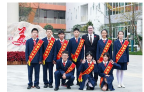
Meeting with students at Chengdu Yinghua School