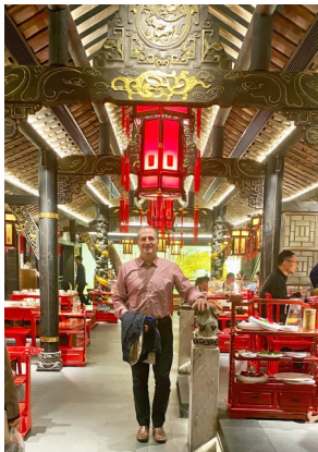
Experiencing the cuisine and culture of Chengdu

How can the OCDSB and OCENET work collaboratively on international education goals?