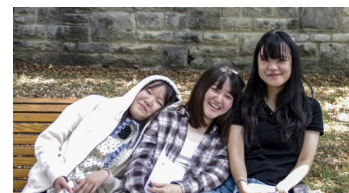
Having fun with a group portrait