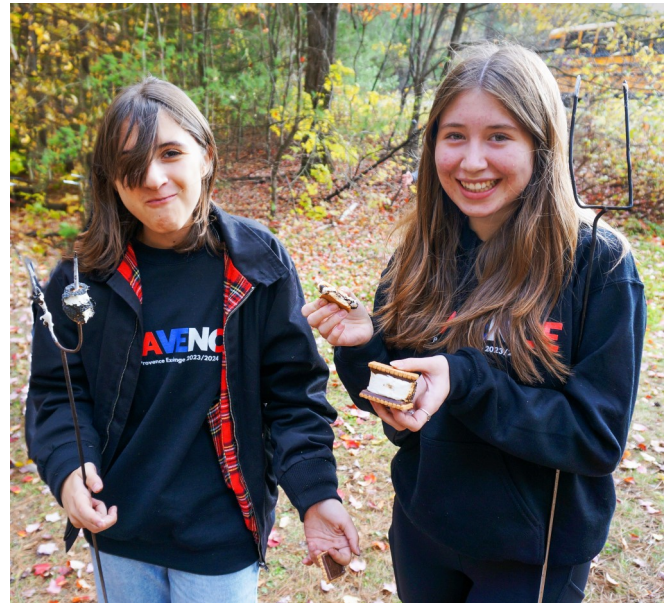
French students on the Provence international student exchange and their local host partners enjoyed a day of hiking followed by a lunch of hotdogs and S'mores at the MacSkimming Outdoor Education Centre

have the opportunity to reunite with their exchange partners and live for 5 weeks with their French host families to experience the second half of the learning exchange.