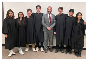
Students from Brazil attended a short term placement in OCDSB schools

While the main role of OCENET is to recruit and support international students who come to study in OCDSB schools, OCENET is very busy in developing learning partnerships between educators and students from around the world with local students and teachers.