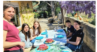
Living with a French family offers a unique cultural experience for OCDSB students

And looking forward to the next school year, 39 OCDSB students from seventeen local schools have been selected to participate in a similar learning exchange opportunity in France.