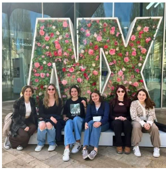
Exchange students from OCDSB schools enjoy Aix-en-Provence