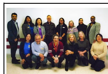
Members of the OCENET staff, along with representatives from Canada Homestay Network and RBC, at the January 30th Orientation Day

money management. The new students received helpful answers to their questions.