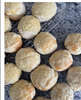
With Homestay Category - Suttida Luo